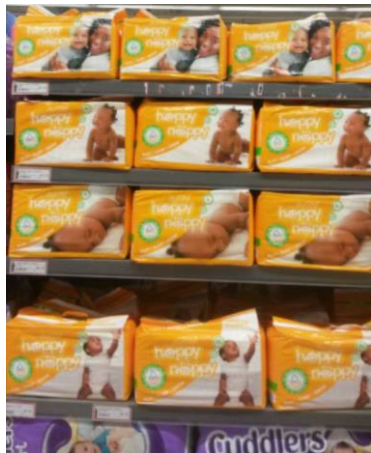
Pick n Pay Mutare