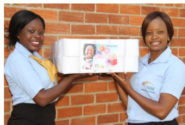
50 Pack Basic & 50 Pack Luxury