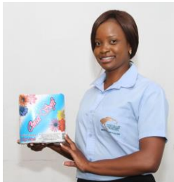
4 Pack Basic