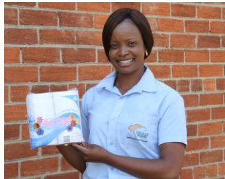
4 Pack Premium