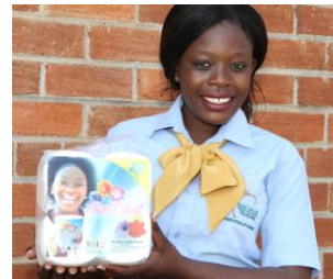
4 Pack Luxury