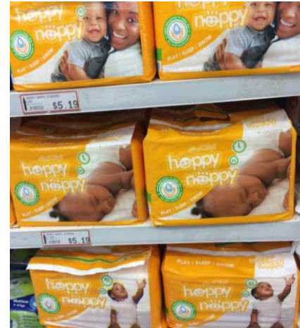
Pick n Pay Bulawayo